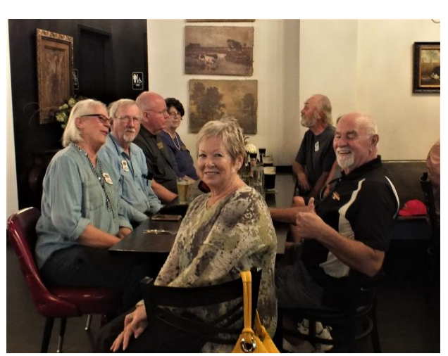
Lunch in Cottonwood