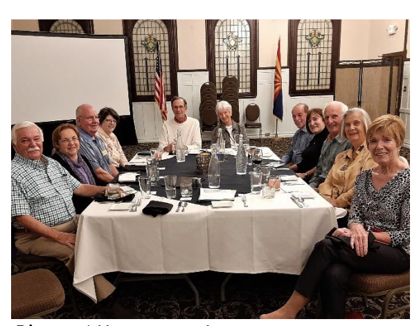
Dinner at Hassayampa Inn