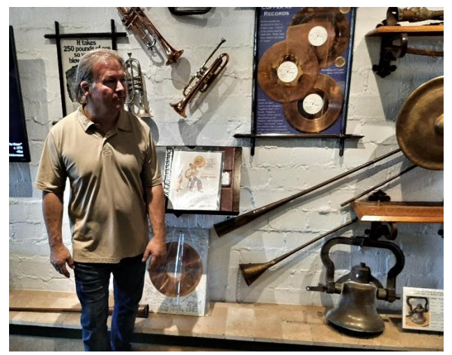
Arizona Copper Art Museum Founder