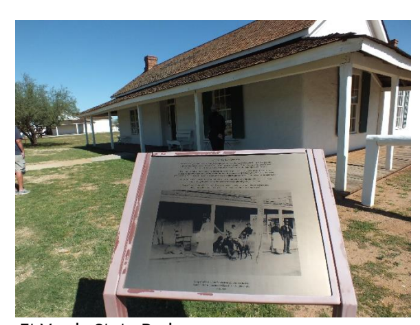
Ft Verde State Park