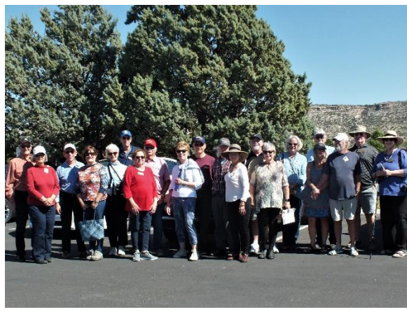
Both clubs' members at Ft Verde State Park