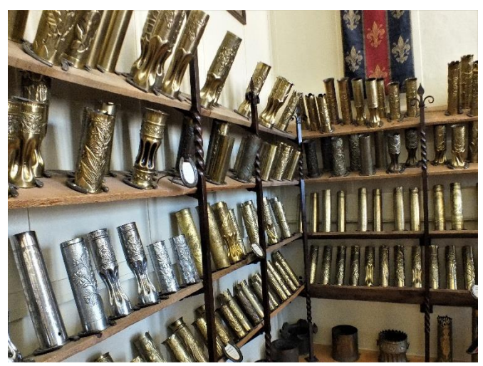
Shell casings turned into works of art