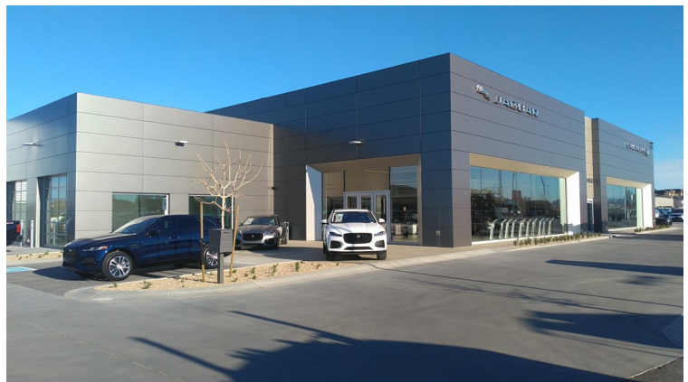
Jaguar Land Rover Arrowhead

The new Jaguar Dealership can be found at: 350 N 101 Loop, Glendale, AZ 85308 (602) 767-4617