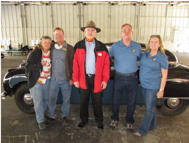
JCSA members at the 2021 Arizona MG show, Goodyear AZ. Jan 16, 2021

For another year of advertising sponsorship