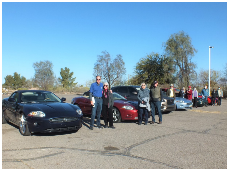
JCSA members at the 2021 Valentines drive to the Chiricahua Mountains, Feb 21, 2020.