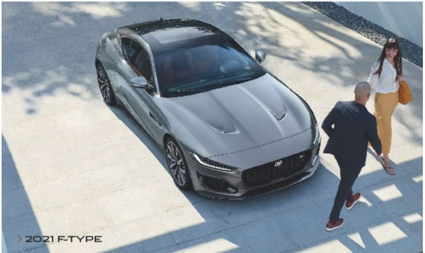
> 2021 F-TYPE