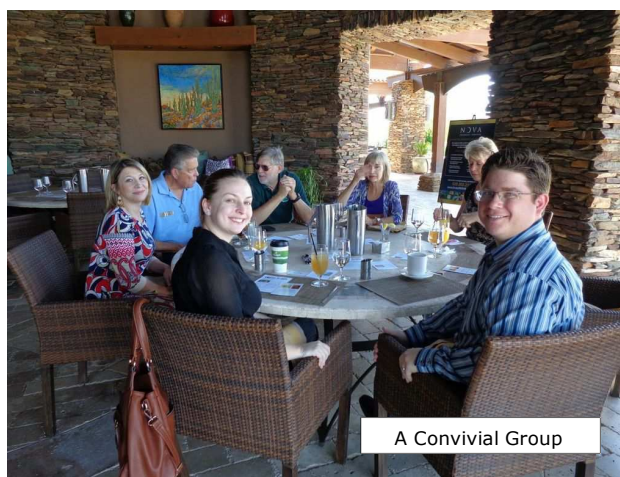
A Convivial Group