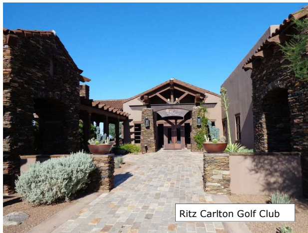
Ritz Carlton Golf Club