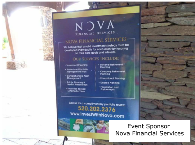
Event Sponsor Nova Financial Services