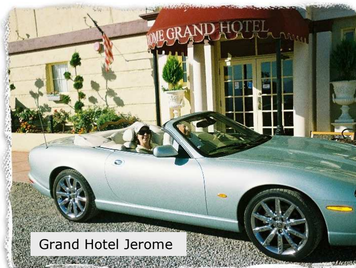
Grand Hotel Jerome

that you will be joining us for the drive. Make sure that you bring your favorite beverage to drink and possibly share with others at the cocktail party. And then meet us at the Shell Station at Ina and Old Father at 7:00 am on the 29 th of September. If you have a cell phone, make sure that you give us the number, so that if necessary while on the drive, we can contact each other.