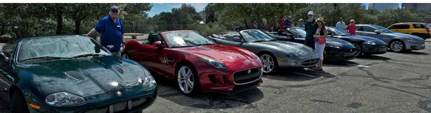
Enjoy our Website www.jcsaz.com