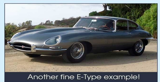
BUYING • SELLING • SERVICING • RESTORING Serving the Jaguar community for over 30 years