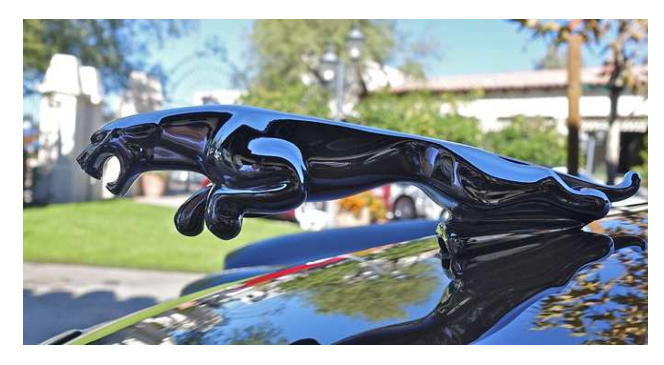
Enjoy our Website www.jcsaz.com