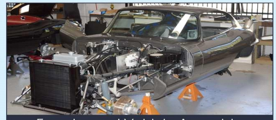
Experienced Vehicle Assembly