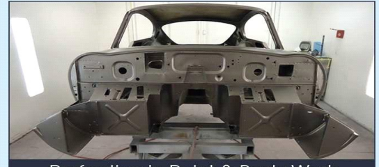
Perfection in Paint & Body Work