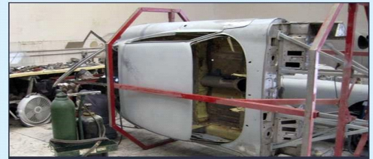
Comprehensive Rotisserie Restorations