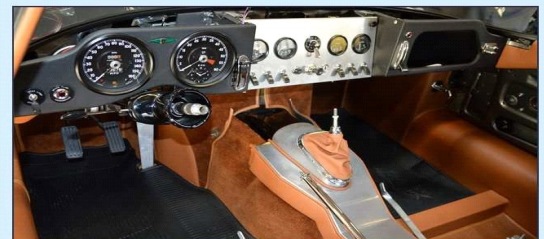
Perfectly Fit Upholstery