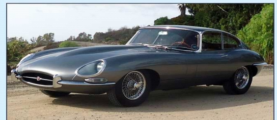
Another fine E-Type example!

BUYING • SELLING • SERVICING • RESTORING