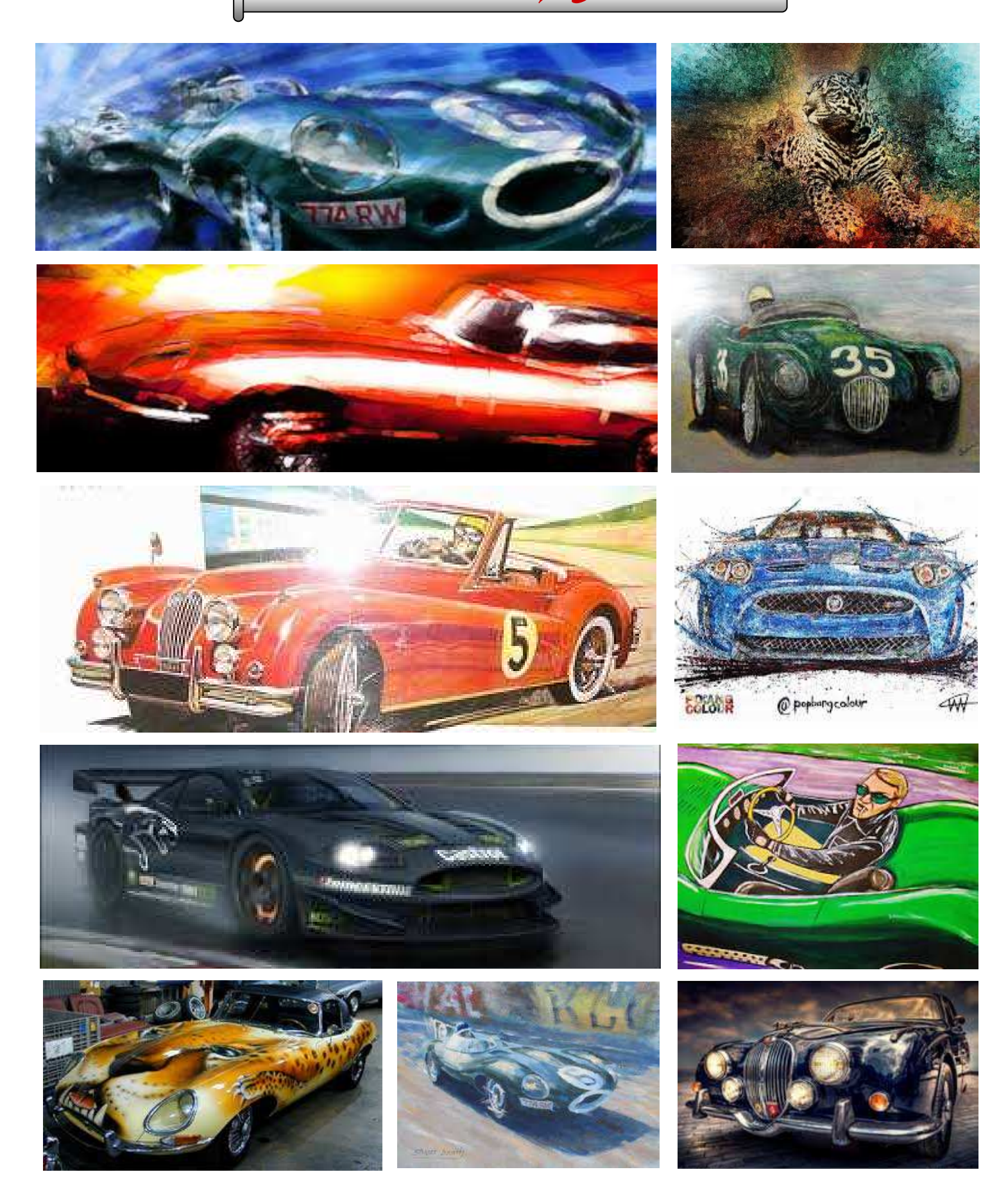
Visit our club's award winning website www.jcsaz.com