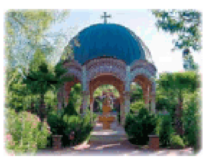
The Central Fountain (Fiali)