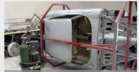
Comprehensive Rotisserie Restorations