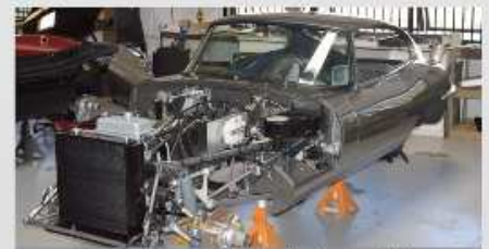
Experienced Vehicle Assembly