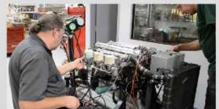
Professional dedication, attention to detail