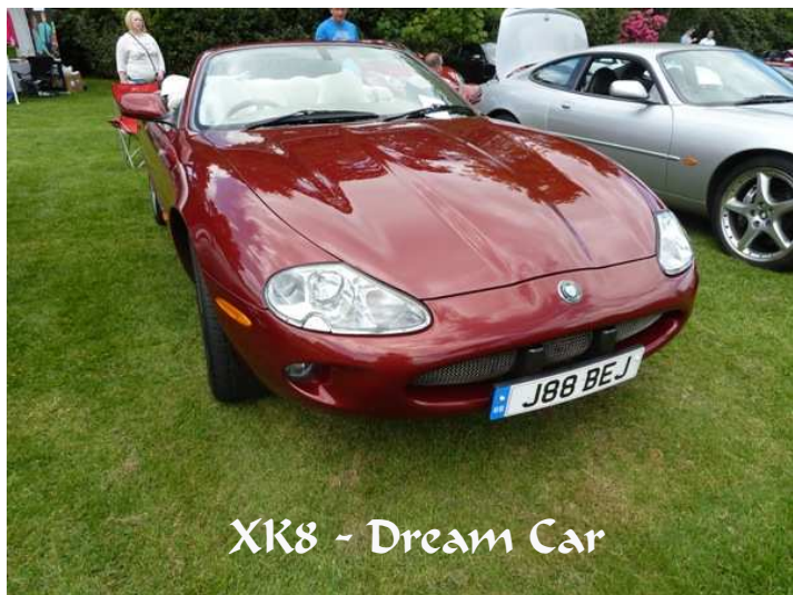
XK8 - Dream Car