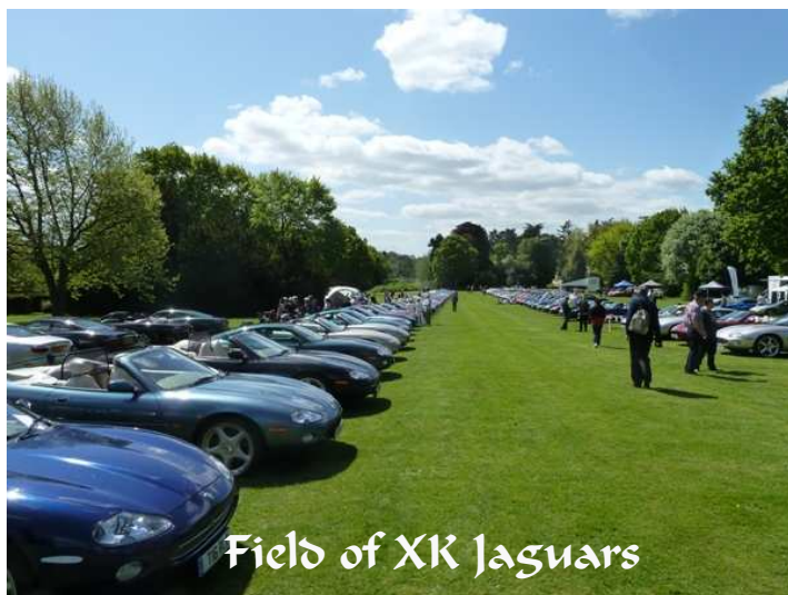
Field of XK Jaguars