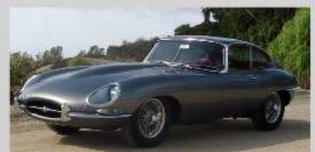
Another fine E-Type example.

BUYING • SELLING • SERVICING • RESTORING