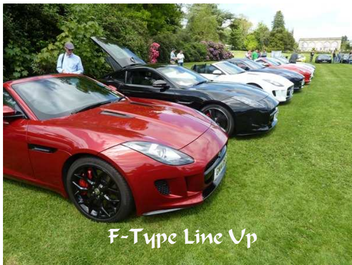
F-Type Line Up