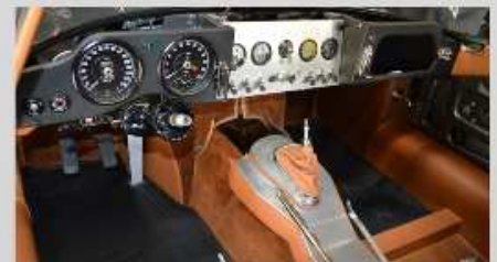
Perfectly Fit Upholstery