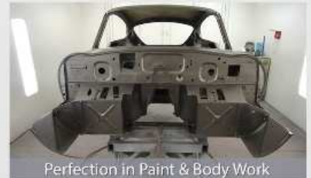
Perfection in Paint & Body Work