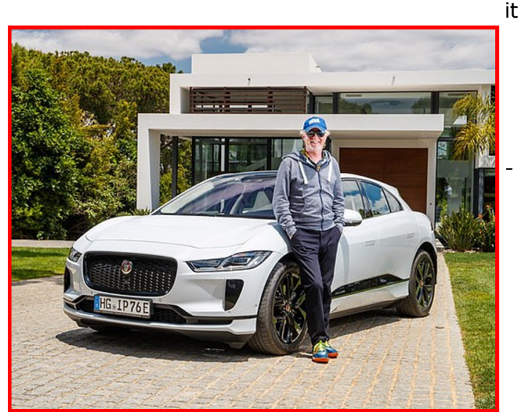
No matter which way one looks at the I-Pace, Jaguar has absolutely nailed the I-Pace design aspect.

The short, aggressive (engineless) nose, which looks as if it's about to hoover up all the tarmac in its path, is reminiscent of the fabulous mid-engined GT cars of the 1960s, specifically the Ford GT40 and Ferrari 250 LM, both design icons. Spooky that both came out in the same year, 1964. Not so spooky, however, that the aforementioned Jaguar chief designer is a huge fan. Take a look at the Bond Spectre C-X75 for yet more clues as to why the I-Pace looks so damn pretty.