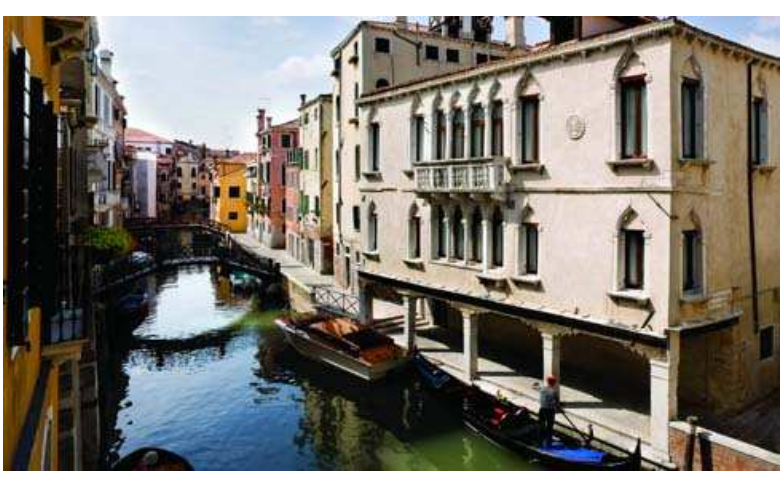
Hotel Una in Venice, Italy