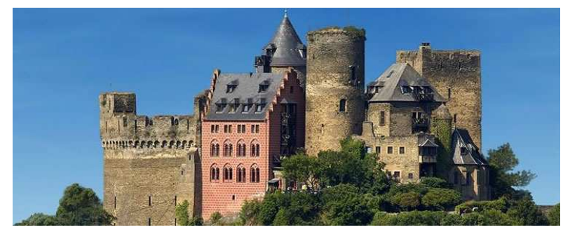
Hotel Castle Schoenburg, Rhine Valley, Germany