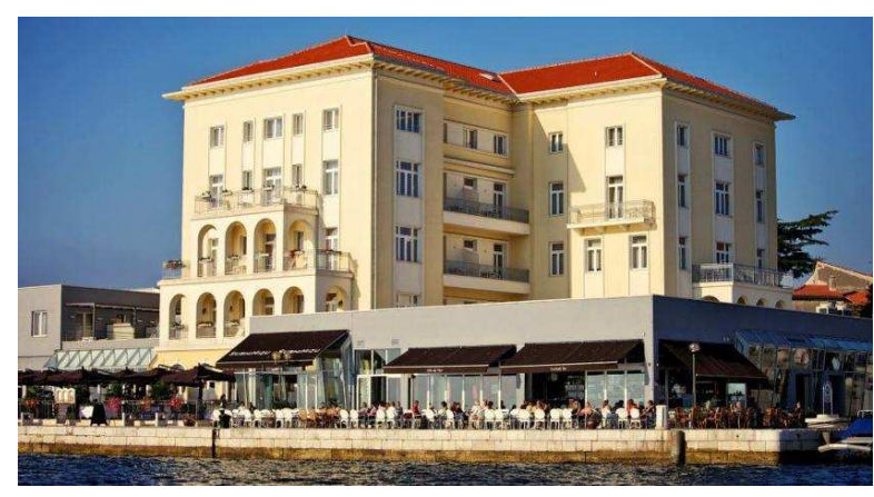
Hotel Grand Palazzo in Porec, Croatia