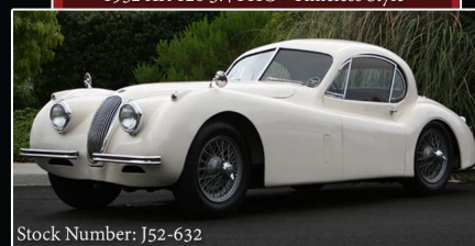
Stock Number: J52-632