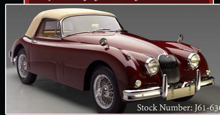
Stock Number: J61-630

1966 XKE Series 1 4.2 OTS • Triple Black Beauty