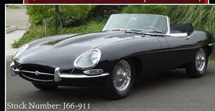
Stock Number: J66-911

1966 XKE Series 1 4.2 OTS • Triple Black Beauty