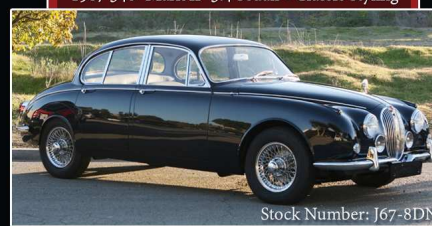
Stock Number: J67-8DN

1967 340 "Mark II" 3.4 Sedan • Classic Styling