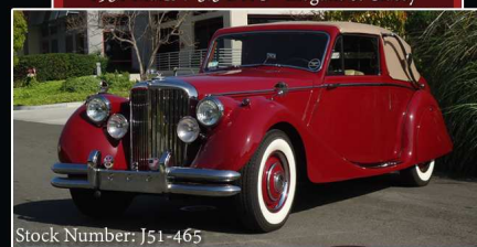
Stock Number: J51-465

1972 XKE Series 3 V12 5.3 OTS • California Car