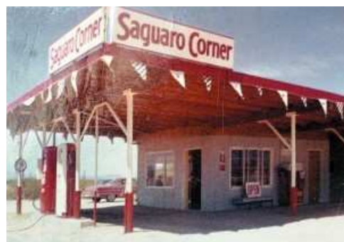
As it was once upon a time