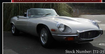
Stock Number: J72-257

1972 XKE Series 3 V12 5.3 OTS • California Car