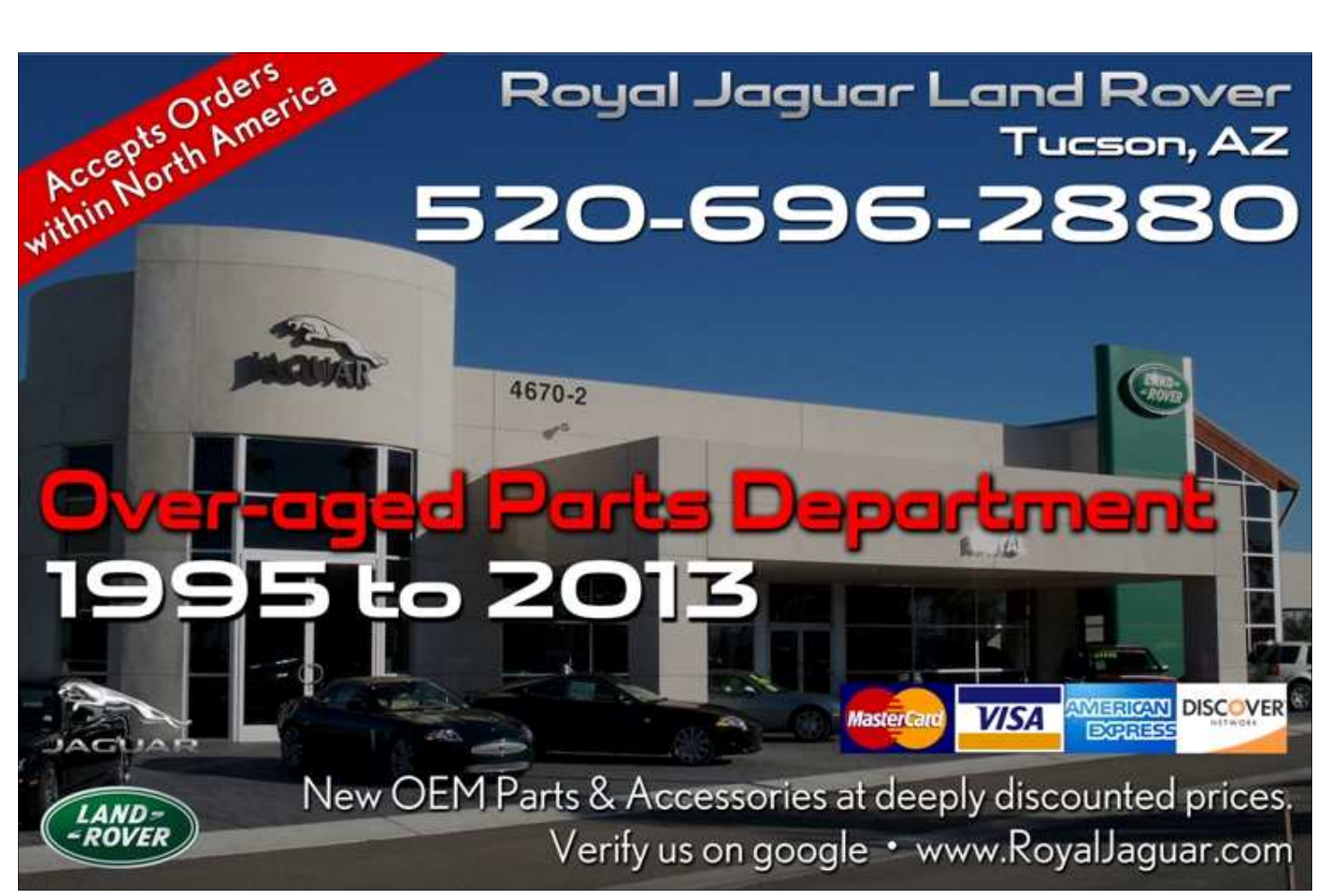
Thank You Royal Jaguar For Your Continued Support of the Jaguar Club of Southern Arizona