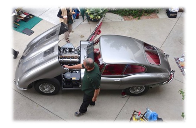
JCSA Concours d' Elegance 2017