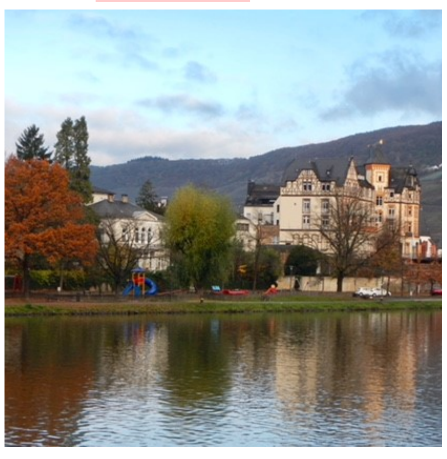
An image along the Moselle river in France.

According to all reports, the Club has staged another highly successful concours and you can read all about it in this issue. We really regret not being able to attend but we were there in spirit (i.e., we knocked off a nice Cabernet in honor of the event). On the 10th of the month (coincidentally my birthday), we left for two weeks in Europe and I'm writing this while sitting in the Pullman Eiffel Hotel in Paris. We started our trip by staying a couple of days in Zurich and then 10 days on a Viking river cruise from Basel to Trier. We will stay 4 days in Paris before returning the day after Thanksgiving. We wish everyone a great holiday season and look forward to our visit starting in February.