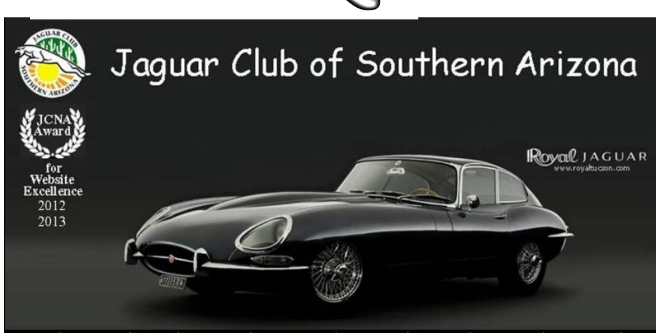
Visit our club's Brand New website. Click on <a href="http://www.jcsaz.com/">http://www.jcsaz.com/</a>