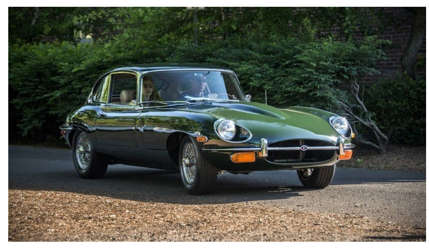
Series II E-Types are easy to tell apart by the uncovered headlights and the lack of a chrome grille masking the front opening.

The Series II E-Type debuted in 1968 after a short run of transitional cars known as Series 1.5 in 1967 and 1968. Series II cars dropped the glass headlights while gaining a larger grille opening, and receiving restyled front and rear bumpers and fascia's. Side indicators became larger and moved to just below the front bumpers, in contrast to the slimmer side indicators that sat immediately below the headlights on the Series I cars.