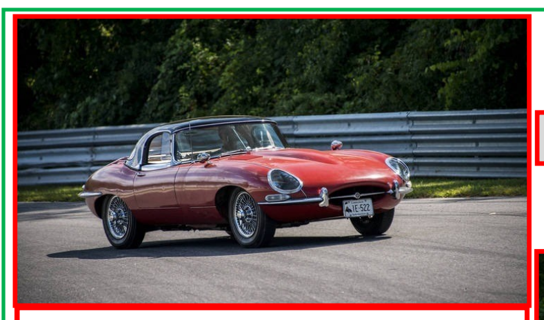
Three series of the Jaguar E-Type

Newsletter of the Jaguar Club of Southern Arizona