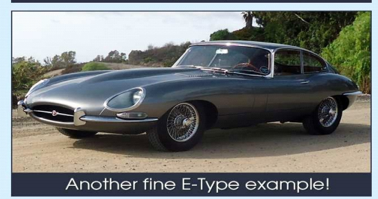
BUYING • SELLING • SERVICING • RESTORING Serving the Jaguar community for over 30 years