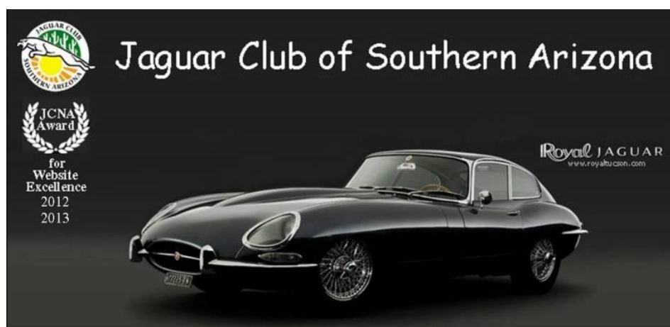
Visit our club's Brand New website. Click on <a href="http://www.jcsaz.com/">http://www.jcsaz.com/</a>