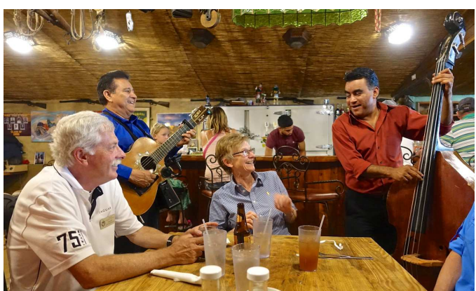
Enjoy our Website www.jcsaz.com